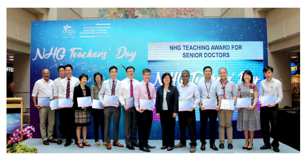
The recipients of the inaugural NHG Teaching Award for Senior Doctors