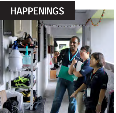
Getting a Sense of the Community